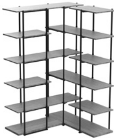
Bamboo 5 High Corner width 47.2, depth 47.2, height 73.8"