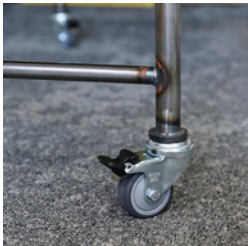
Table with lockable casters