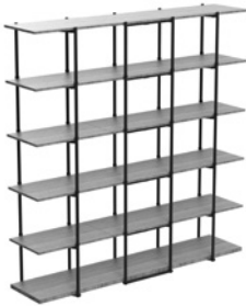
Bamboo 5 High - 1800 width 70.9, depth 17.3, height 73.8"