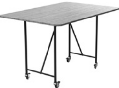
Bamboo Table on Casters width 47.2, depth 31.5, height 29.1"