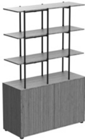
Bamboo 5 High Double Cupboard width 47.2, depth 18.7, height 73.8"