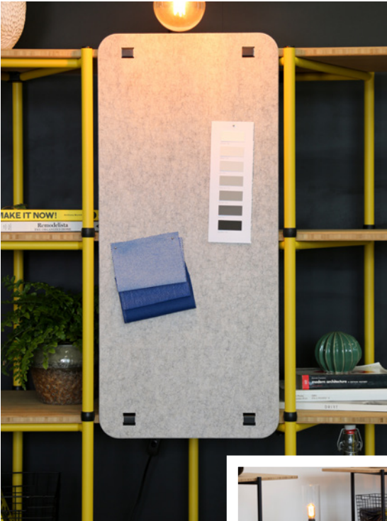
Moveable Felt Panel with acoustic benefits and pinboard use, attaches to two bamboo shelves