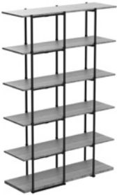
Bamboo 5 High - 1200 width 47.2, depth 17.3, height 73.8"