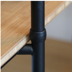
Easy to assemble with recycled nylon (PA6) connectors